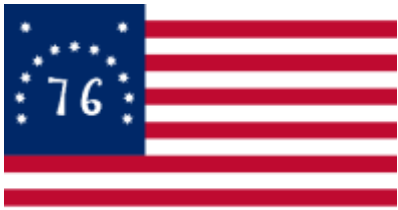
Battle of Bennington 13 Stars