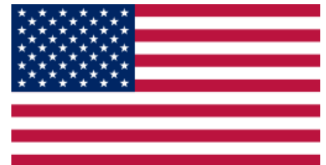
50 Stars 1960 – Present