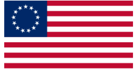
1792 Betsy Ross 13 Stars