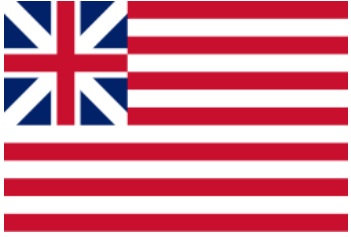
1775 – 1777 Continental Union

Over the years, Congress has approved changes to the design of the flag, including the addition of stars and bars to represent the number of states in the Union. There's often a lag between when states were admitted to the Union, and when the flag was updated. For example, there were actually 18 states during the War of 1812, but the flag sported 15 stars and 15 stripes during that conflict, and was not updated until several years later.