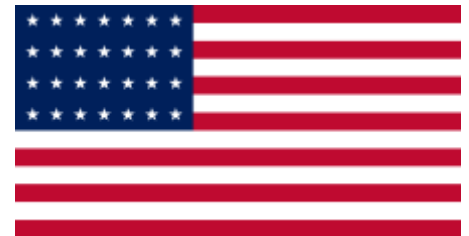
1846 -1847 28 Stars