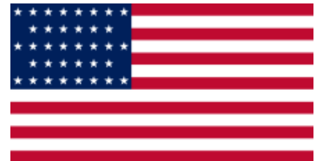
1865 -1867 36 Stars