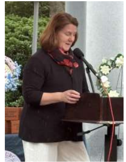
Kerry Devine, Mayor of Fredericksburg