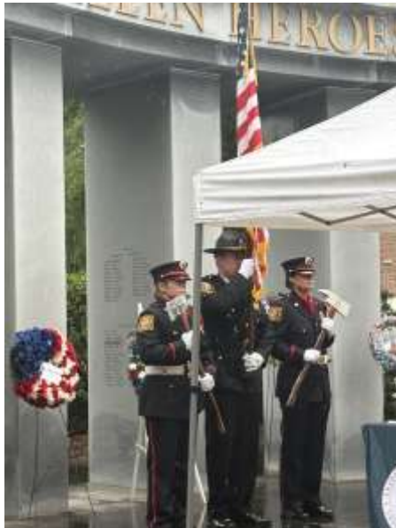
Firefighter Color Guard.