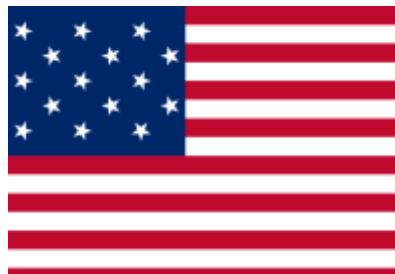
1795-1818 15 stars 15 stripes